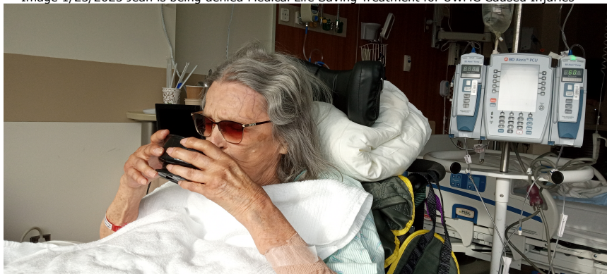
Patient Parotid Infection is not being treated, patient is processed for death only